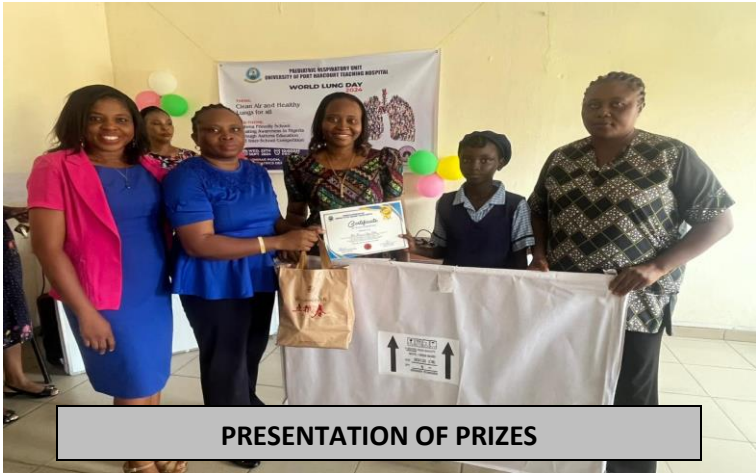
PRESENTATION OF PRIZES