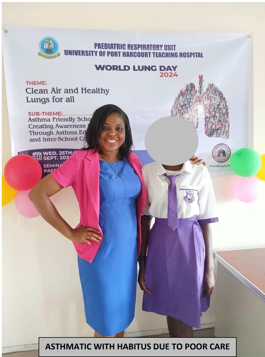
ASTHMATIC WITH HABITUS DUE TO POOR CARE