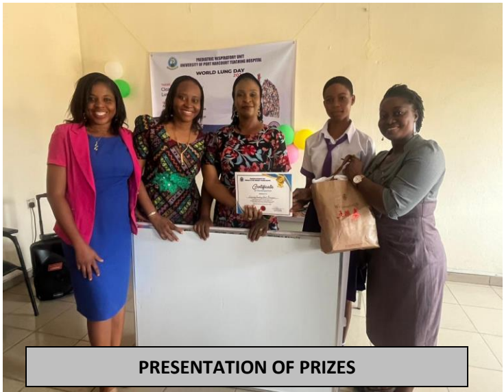
PRESENTATION OF PRIZES