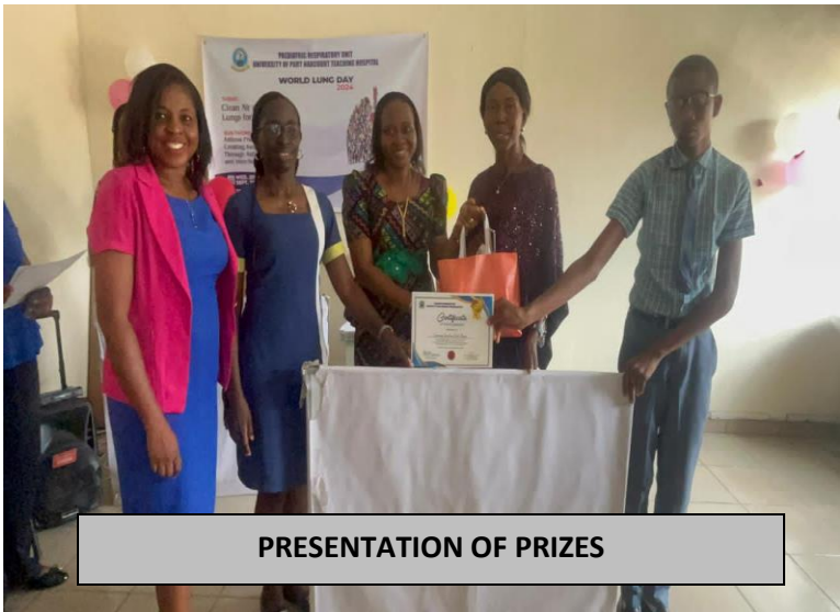
PRESENTATION OF PRIZES