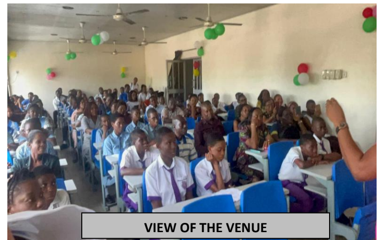
VIEW OF THE VENUE