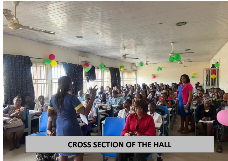
CROSS SECTION OF THE HALL