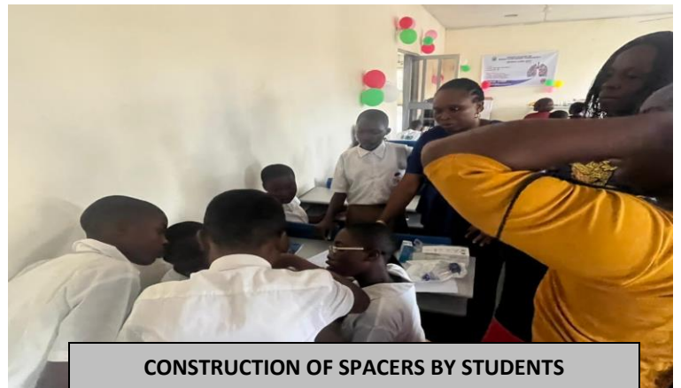
CONSTRUCTION OF SPACERS BY STUDENTS