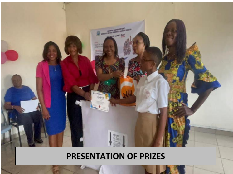
PRESENTATION OF PRIZES