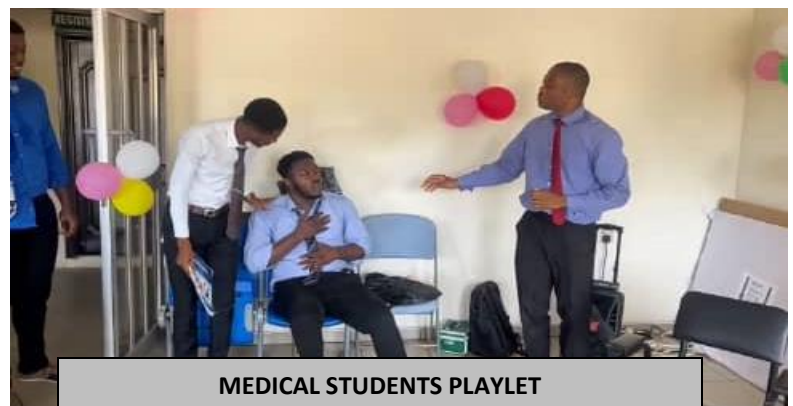
MEDICAL STUDENTS PLAYLET