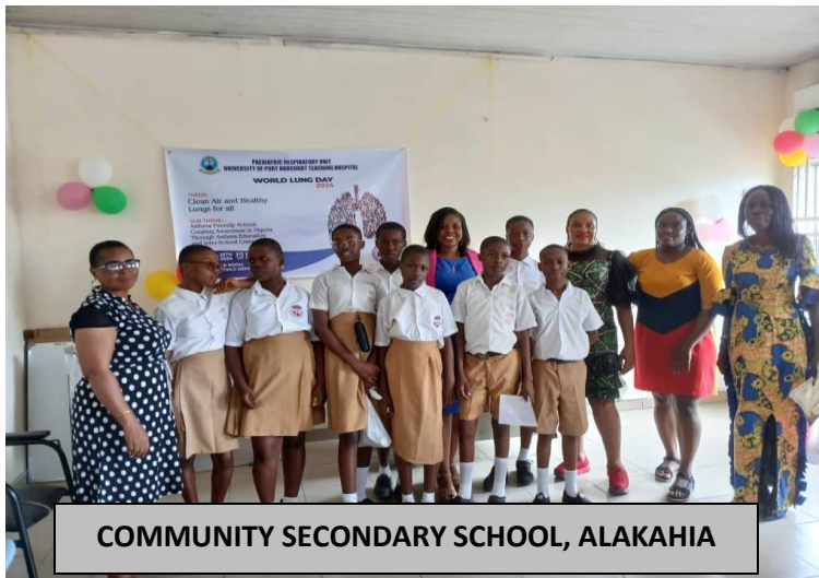
COMMUNITY SECONDARY SCHOOL, ALAKAHIA