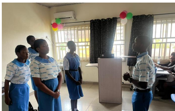
PLAYLET BY UNIVERSITY DEMONSTRATION SECONDARY SCHOOL, ALUU