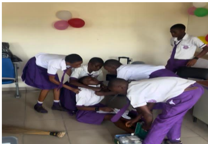
PLAYLET BY COMMUNITY SECONDARY SCHOOL, RUMUAPARA