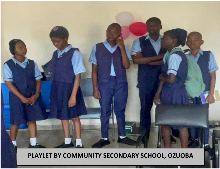
PLAYLET BY COMMUNITY SECONDARY SCHOOL, OZUOBA