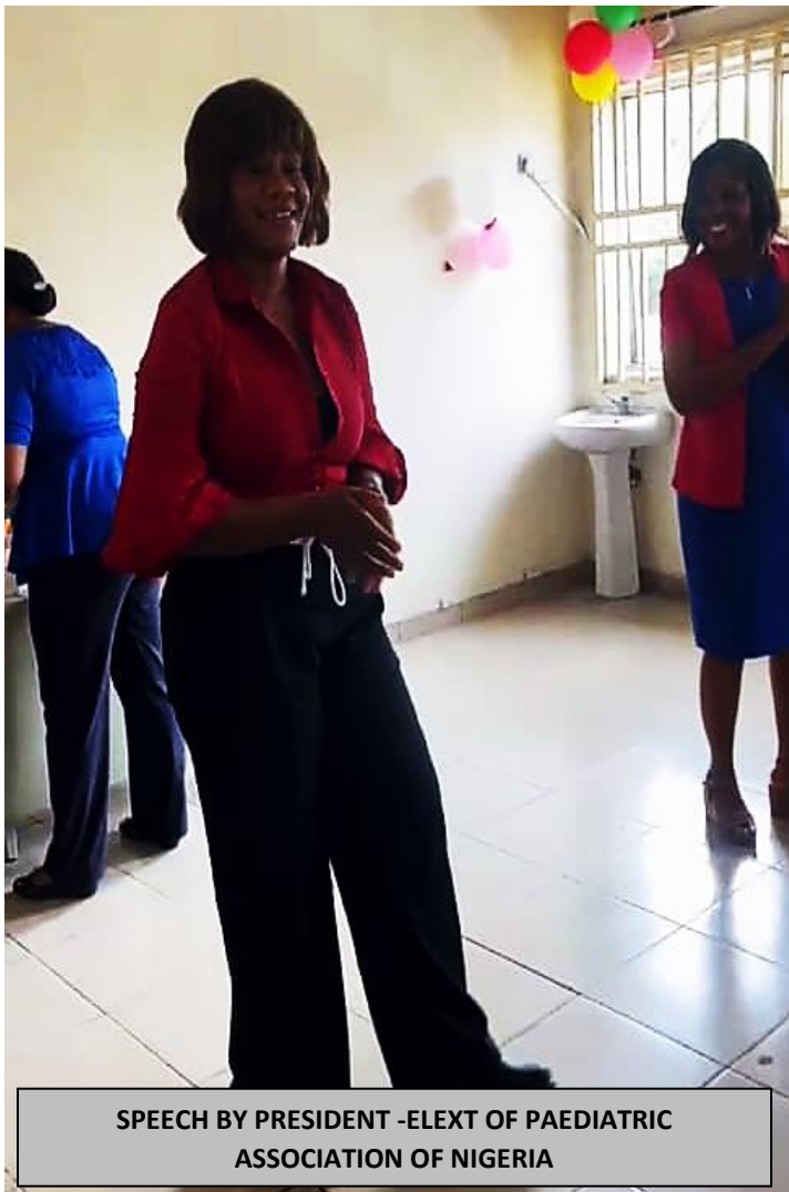
SPEECH BY PRESIDENT -ELECT OF PAEDIATRIC ASSOCIATION OF NIGERIA