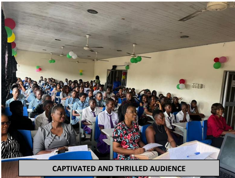
CAPTIVATED AND THRILLED AUDIENCE