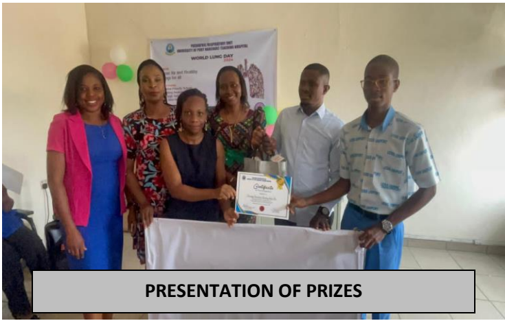
PRESENTATION OF PRIZES