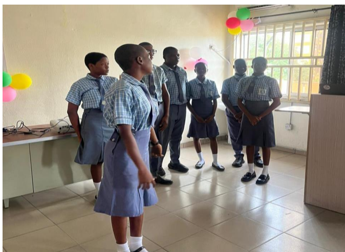
PLAYLET BY OLOBO PREMIER COLLEGE, CHOBA