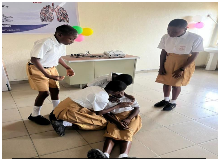
PLAYLET BY COMMUNITY SECONDARY SCHOOL, ALAKAHIA