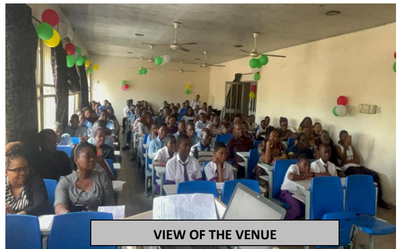
VIEW OF THE VENUE